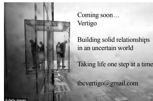
Look for information in the next issue of the Triquetra

*You'll receive map of Cordova area, and assist with 3 to 4 blocks